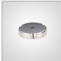
401 back cap