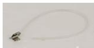
201 water spray nozzle