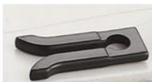
201CA cap spanner