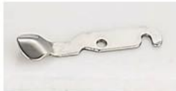
201CA bur key