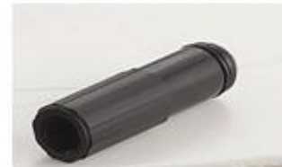
201 oil spray nozzle