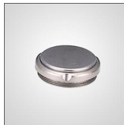
302 push button cap