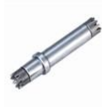
201CA middle gear