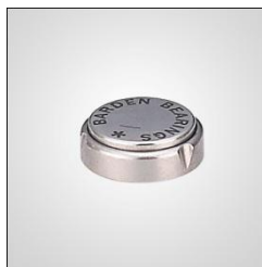
401P push button cap