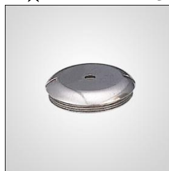
403 back cap