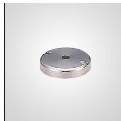
402 back cap