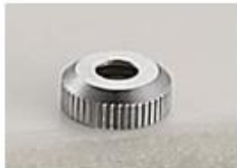
201CA front cap