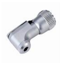
201CA head(with cartridge)