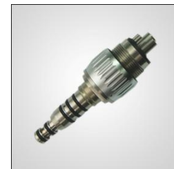
302PB quick coupling