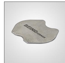
402 cap spanner