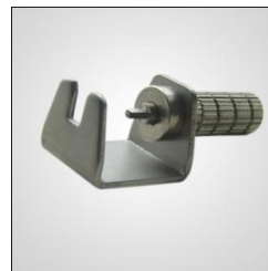
402 bur key