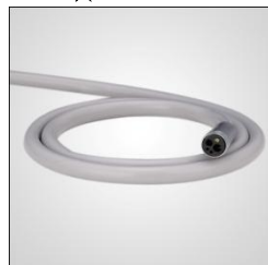
Fibre optic tube