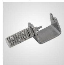
403 bur key