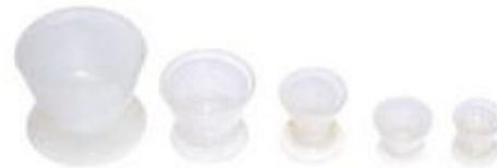
X-124 X-125 X-126 X-127 X-128

Resistant to the high temperature of 135. Flexible silicone rubber materials. Five different sizes to fit your different jobs. Washable for repeated use. Sucker cup bottom, with easy to put the bowls firmly on the smooth surface as glass, etc.