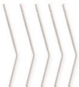
Q-113-3 Air water syringe tips Without metal

syringe tips with no separation of the air and water with white plastic tube.