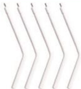
Q-113-1 Air water syringe tips With Metal

Air water syringe tips with stainless steel inner pipe and white plastic tube.