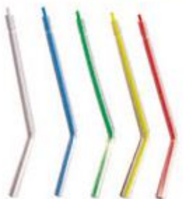
Q-113-2 Plastic Air water syringe tips

Universal three-in-one Air water syringe tips, colored rigid plastic inner pipe (blue, green, white, yellow, purple) and clear plastic tube.